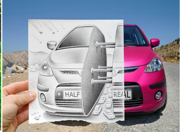
© 2017 Ben Heine, A Pink Car