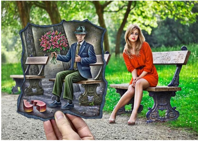
A Date in the Park